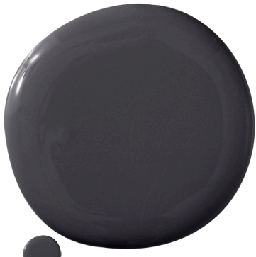
TEMPTATION 1609 BENJAMIN MOORE

"In the Mississippi Delta, the sun can be overpowering at midday, when my client is in her study. So I painted the walls, moldings, and bookcases in this flint gray, a true gray that doesn't go purple or blue. With bleached floors, a white ceiling, and Belgian linen on the furniture, the room feels cool and calm."