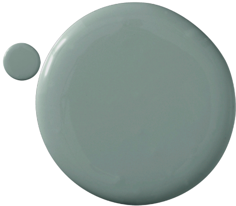
CHAPPELL GREEN 83 FARROW & BALL

House Beautiful's iPad app—available on iTunes—makes it easy to find the perfect color for any project. A special feature also picks the best complementary colors.