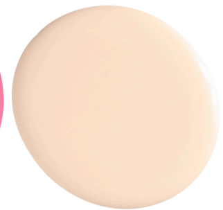
SAN DIEGO CREAM 921 BENJAMIN MOORE