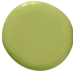
HIGH STRUNG SW 6705 SHERWIN-WILLIAMS

"This is a brilliant green, deeper than chartreuse. It's kind of like sunlight through a leaf. And it comes as a surprise in the library of an apartment in an all-glass skyscraper, where the rest of the rooms are fairly beige. It reminds you of the grass and the greenery outside."