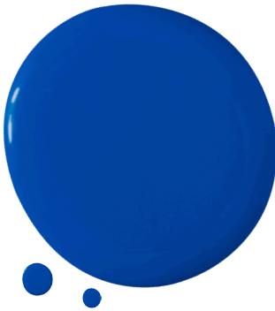
EVENING BLUE 2066-20 BENJAMIN MOORE

"I'll often use this Yves Klein blue to dramatize a room. Paint it on one wall and you are instantly transported to an island in Greece, where you'll see this hue in the water and on window frames against white-washed walls. It makes me feel as if I'm basking in the sun."