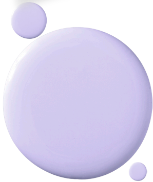
LAVENDER CLOUD 90BB 67/069 GLIDDEN

"Here in the South, a sunny room can quickly get blazing hot. Texans will do anything to escape the heat, including enveloping a room in a dark color to drop its visual temperature. This navy blue evokes a cool and peaceful starry night sky. It's deep enough not to get washed out by the sun and matte enough to absorb the light." EMILY LARKIN