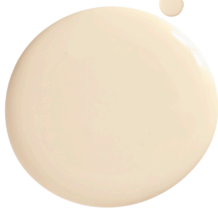
IVORY PALM 6012P FINE PAINTS OF EUROPE GLIDDEN

"The secret to this lavender is that it moves toward gray. It's a suggestion of lavender, rather than dead-on, so it can be very ethereal in the sun and then deeper in the evening. It's a good universal shade—soft and soothing in a bedroom or elegant and quiet in a living room." JAMES RADIN