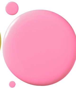
TICKLED PINK 2002-50 BENJAMIN MOORE

"For a sunroom, I like this acidic yellow with undertones of green and brown, to ground it and keep it from feeling too saccharine. Colors appear lighter in bright rooms, so go a shade deeper than you first think. Layer in sea grass, overstuffed wicker furniture, maybe a pop of coral, and creamy white trim. It will feel happy by day and sophisticated by night." PALMER WEISS