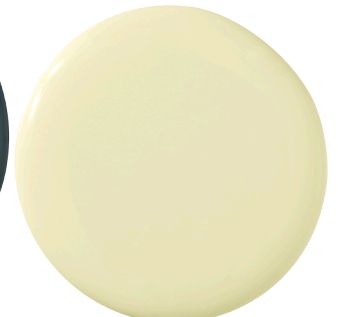
LIME RICKY 393 BENJAMIN MOORE

"I like a light but bright color in a sunny room. This yellow-green is so refreshing and crisp, you almost feel as if you're sipping a lime daiquiri by the pool! And like rum, it mixes well with anything. Pair it with navy blue to go preppy, pink to go bold, or chocolate brown to tone it down."