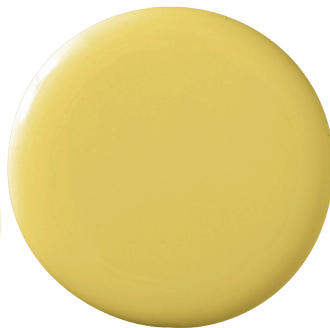
SPICY BANANA PEPPER 50YY 60/538 GLIDDEN