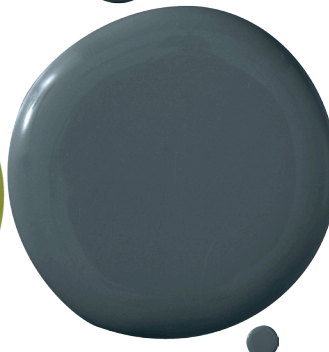
STILL WATER SW 6223 SHERWIN-WILLIAMS

"When the sun hits a wall, it takes the color down a notch or two. But this dark teal blue, with undertones of gray and green, is dark enough that it still looks rich and interesting. I used it on the sunporch of a 1920s Dutch Colonial, where it was a nice complement to terra-cotta floors. The unexpected color draws you into the room."